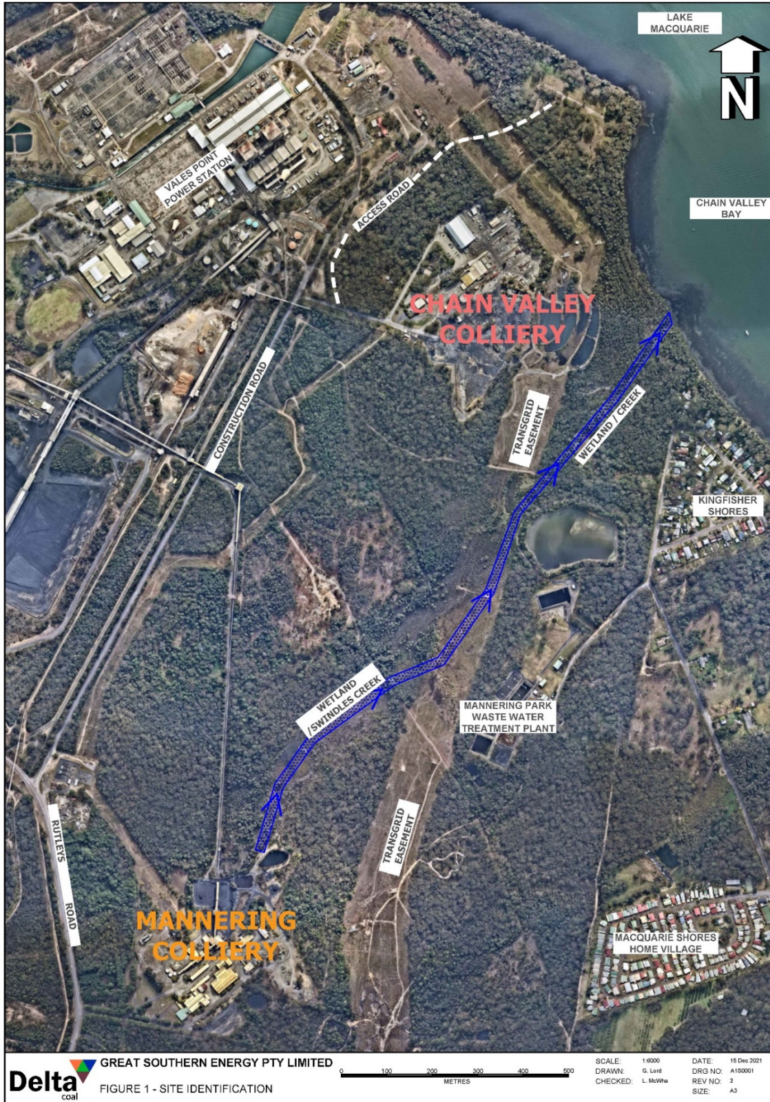
Figure 1 – Mannering Colliery Site and Surrounds